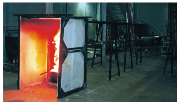
FM 4922 test.